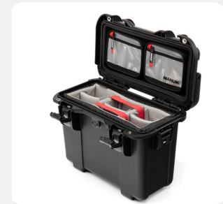
Pro Photo Kit