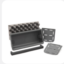
Tray & Rigid Dividers