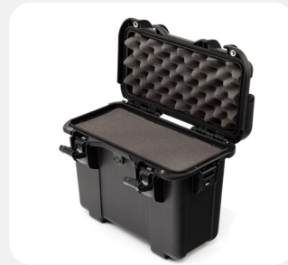
Cubed Foam & Eggshell