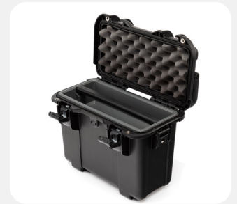
Tray & Rigid Dividers