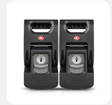
TSA Powerclaw Latch Retrofit Kit