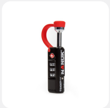
Nanuk TSA Padlock