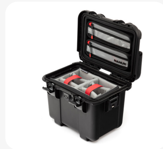
Pro Photo Kit