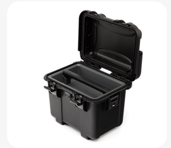
Tray & Rigid Divider