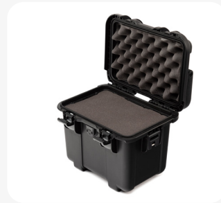
Cubed Foam & Eggshell