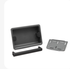
Tray & Rigid Divider