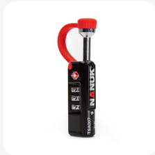
Nanuk TSA Padlock