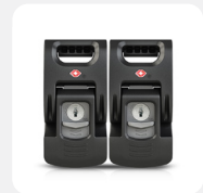
TSA Powerclaw Latch Retrofit Kit