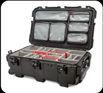
Pro Photo Kit