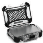
Aluminum panel kit