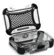
Lexan panel kit