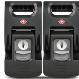
TSA Latch Retrofit Kit