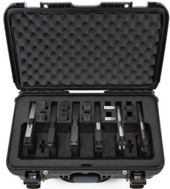
935 6UP Gun Case

Interior dimensions L17.0" × W()11.8" × H6.4" L432mm × W()300mm × H163mm Exterior dimensions L18.7" × W()14.8" × H7.0" L475mm × W()376mm × H178mm