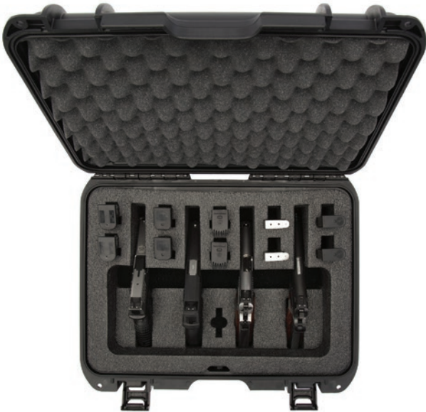
925 4UP Gun Case