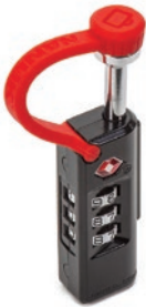
TSA Accepted Case lock