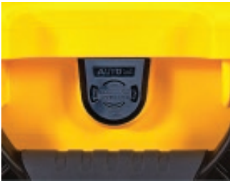
Pressure equalizer valve