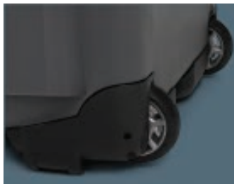
Polyurethane smooth wheels