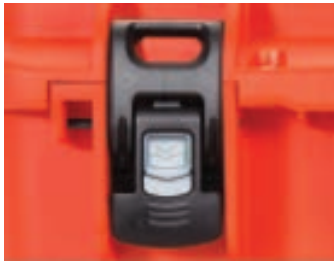
Powerclaw superior latching system