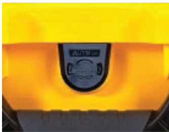
Pressure equalizer valve