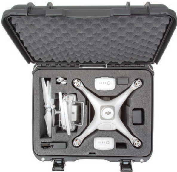
933 For DJI™ Phantom 4 RTK

Interior dimensions L18.0" × W()13.0" × H9.5" L457mm × W()330mm × H241mm Exterior dimensions L19.9" × W()16.1" × H10.1" L505mm × W()409mm × H257mm